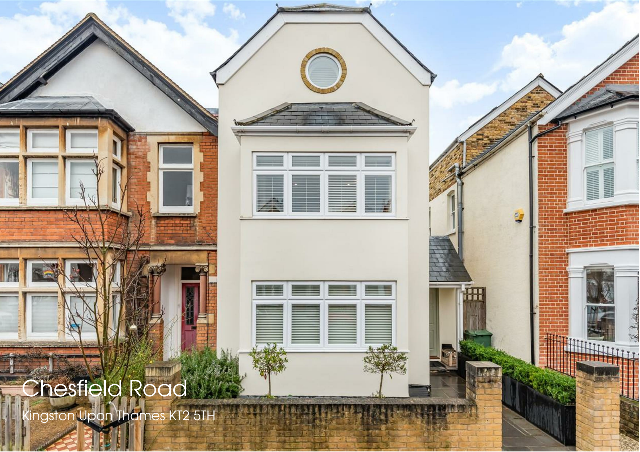
Chesfield Road Kingston Upon Thames KT2 5TH

34 Richmond Road Kingston upon Thames Surrey KT2 5ED www.gibsonlane.co.uk Tel: 020 8546 5444